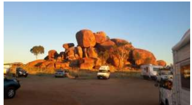
The Devils Marbles

A night at Devil's Marbles interrupted our journey to Tennant Creek and then on to Daly Waters. The Pub there has the best Beef & Barra meals and some good entertainment out the back. Not much else is there so after a few beers and a good night's sleep we headed to Mataranka and the hot springs!